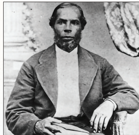
The Mt. Rose Church and Mt. Seriah Campus in Watrousville, at top. Above, an undated photo of Benjamin Watrous, minister and delegate to the Texas Constitutional Convention of 1868-69. From tshaonline.org