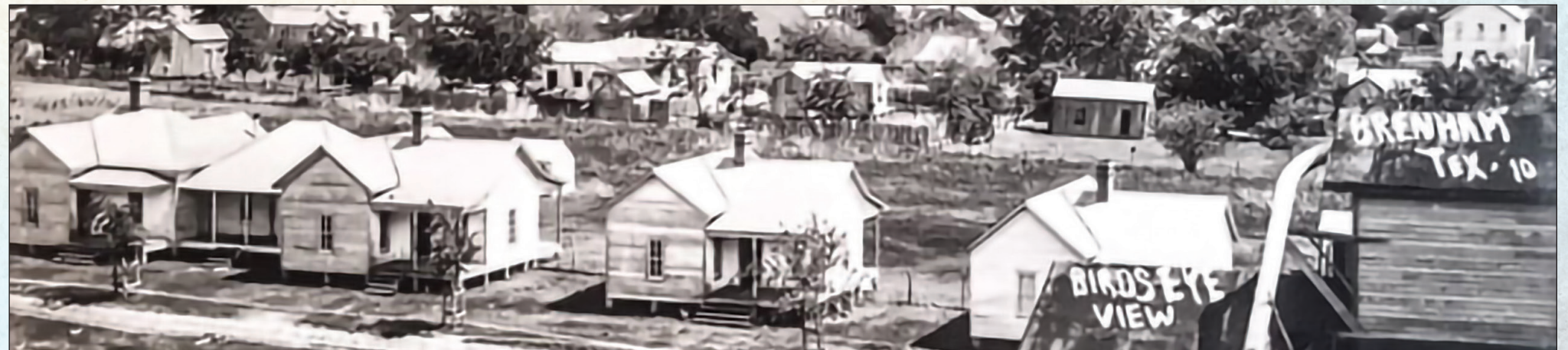
BELOW: The Freedom Colony of Camptown, established in the 1860s near Brenham, included three churches, seen in the foreground of this 1910 photo.