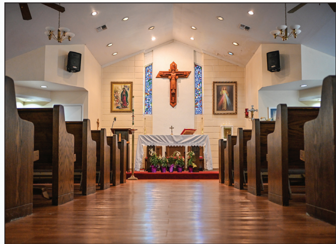
Above, at Spann's Settlement, the interior of Blessed Virgin Mary Chapel. At right, a hymnal in the chapel.

"In 1969, land deeded to descendants of the Sweed family by the Spann family became the site of a new church building, the Blessed Virgin Mary Chapel, and a hall for the African American Catholic community," according to the historical commission. "In 1995, the community constructed the newest church building in Washington, which continues to serve the region's Black Catholics, including descendants of the Sweed family." The church is at 17370 Sweed Road.