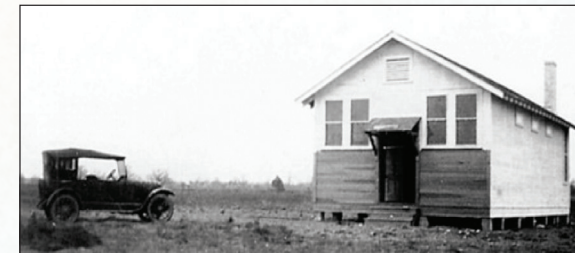
The Hopewell Rosenwald School in 1922. The building still stands at 690 State Highway 21.

Now a burgeoning, semirural swath between Bastrop and Austin, the Cedar Creek area was home to many Black settlers and more than one Freedom Colony after the Civil War. In 1914, Cedar Creek had 225 residents, four general stores, a gin, a tailor, a doctor, and a cattle dealer, according to the Handbook of Texas. Just to the northeast on State Highway 21, the Hopewell Rosenwald school for Black children opened in 1922. Though it closed in the 1950s, it is among the most intact of 464 Rosenwald schools built in Texas. Construction of those schools — almost 5,000 in rural areas across America between 1917 and 1932 — was funded by Julius Rosenwald, the wealthy part-owner of Sears, Roebuck and Co. In 2015, restoration and renovation of the one-room Hopewell schoolhouse began to gain momentum. That work has continued through community initiatives and donations. The school has been a site for events honoring its past and the area's history as a Freedom Colony.