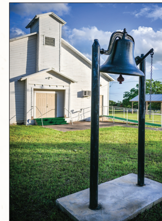
Antioch Baptist Church and its cemetery are still in use today.

These three settlements were clustered about 11 miles east of Giddings, where many freed Black people were able to buy inexpensive land in the decades during and after Reconstruction. Antioch quickly became the largest Black community in Lee County, according to the Texas State Historical Association. “Some of the settlers supplemented their income, which presumably came from farming, by working periodically at neighborhood plantations such as Black's Quarter,” the association said. Antioch Baptist Church and its cemetery near FM 141 are still in use today. A book about Texas Freedom Colonies cites an 1890 interview with a couple who said 12 families from Antioch founded nearby Sweet Home. To the southeast on FM 180, the Post Oak settlement was formed in the late 1800s or early 1900s. A school operated there in the 1930s, and there was also a Baptist church and cemetery. The church and cemetery in the Sweet Home settlement area are still in use today.