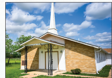
The Shiloh Baptist Church on Littig Street near Elgin holds regular worship services.

The unincorporated community of Littig in far eastern Travis County between Manor and Elgin is believed to be one of the oldest Freedom Colonies in Texas. It took root in the early 1880s on land donated by former slave Jackson Morrow, near where the Wilbarger, Willow and Dry creeks converge about two miles south of today's busy U.S. 290. Vestiges of the community, which prospered on good Blackland Prairie farmland, still stand on Littig Road, which is also County Road 76. At its peak, the town boasted schools, a post office (run by the state's first Black postmaster), a general store, two cotton gins and three churches, according to the Texas State Historical Association. Littig's population dropped from about 150 people in 1936 to 35 by the 1940s. It is still home to a small, mostly Black population. About 315 acres of Morrow's original land is owned by a conservation trust and is being developed into a farming cooperative.