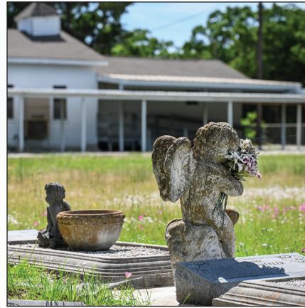
The cemetery at the Sweet Home Baptist Church in Somerville holds the remains of residents of both the Birch Creek Freedom Colony and another nearby settlement.

The Birch Creek Freedom Colony settlement north of Somerville in southern Burleson County was established around 1890, anchored by the Sweet Home Baptist Church. Though the church has been remodeled several times since, “many original aspects are still there, such as the original log that parishioners sat upon,” according to the website of the Heirloom Project, which researched Freedom Colonies in the county. The church served a network of Black communities in the region. The cemetery at the church also holds the graves of those buried at another Freedom Colony that were relocated with the construction of Lake Somerville.