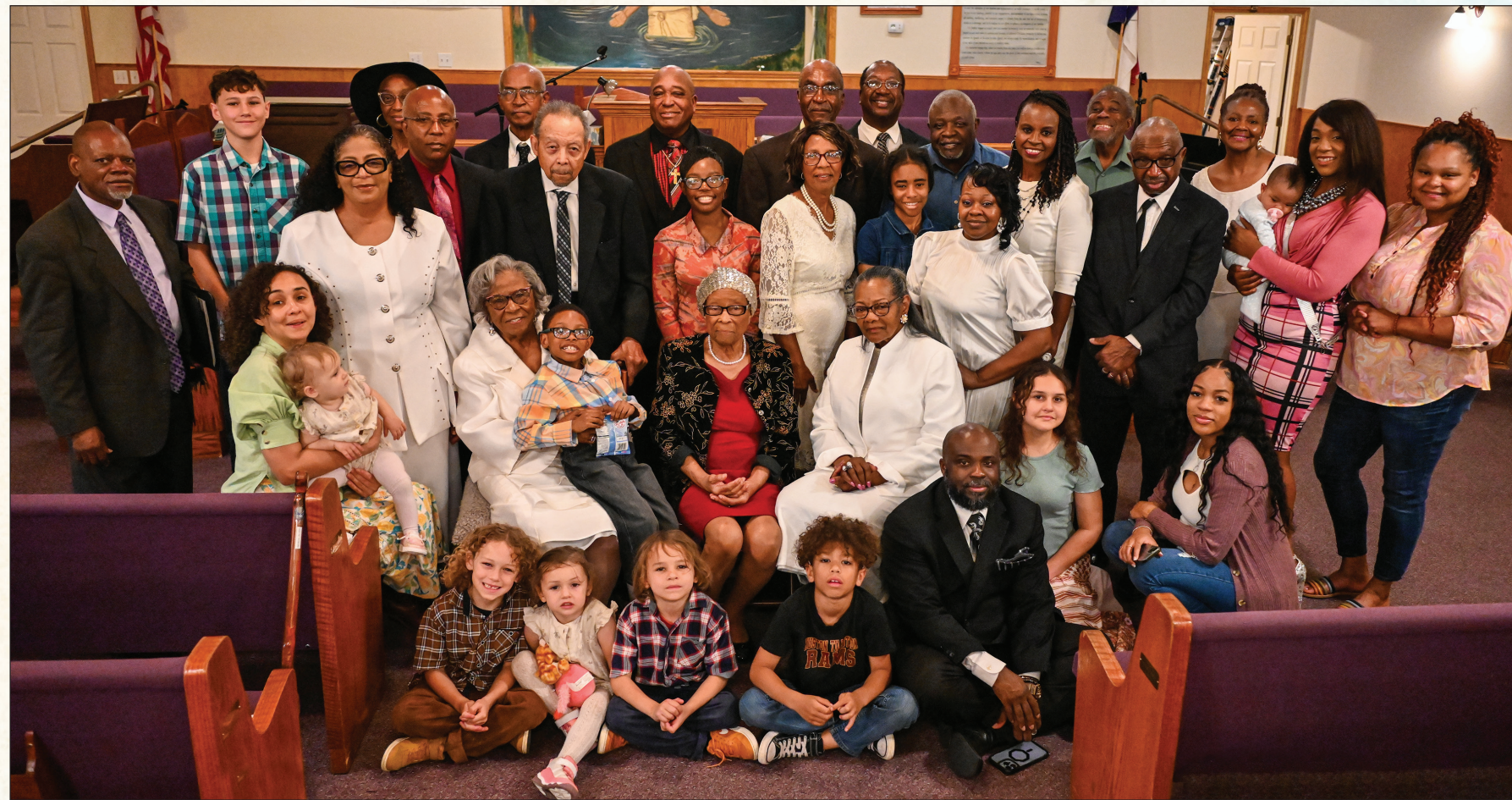
MIDDLE: Sunday services at St. John Regular Baptist Church are still well-attended. The church remains the heart of the Freedom Colony of St. John, founded in the 1870s in Caldwell County. Learn more, Page 18.