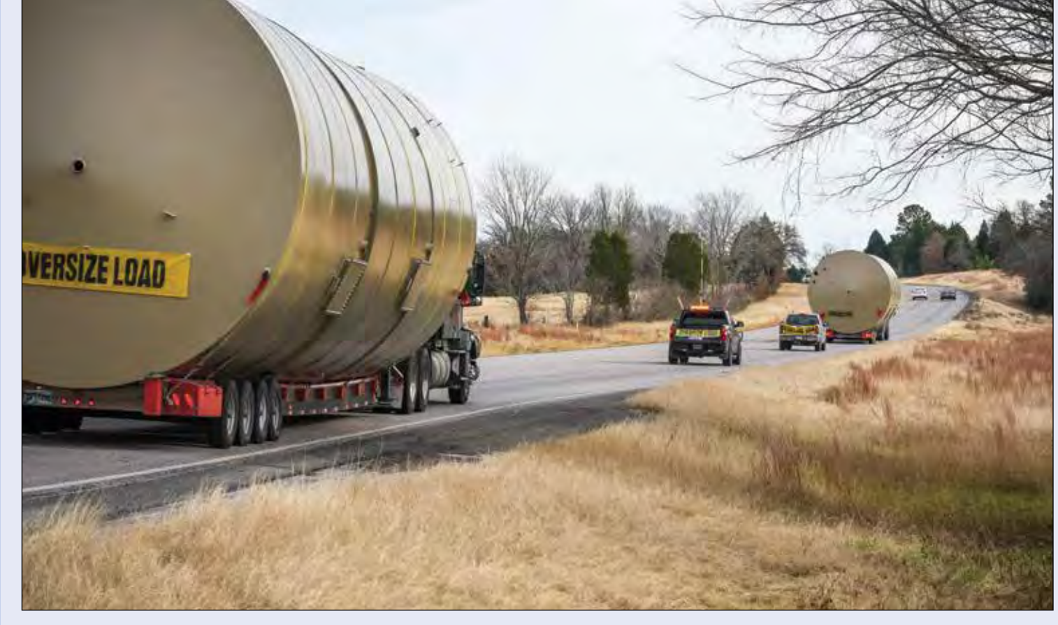
TxDOT plans to add medians and ample road shoulders throughout the 11-mile stretch of U.S. 290 between Paige and Giddings. Construction is expected to begin by the end of this year.